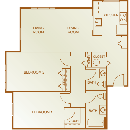
2 Bedrooms Corner 962 Square Feet

Floor plans shown are representative and exact floor plans and measurements may vary. Additional floor plans available.