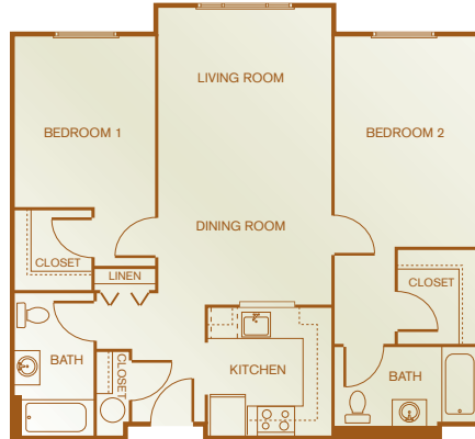
2 Bedrooms 936 Square Feet